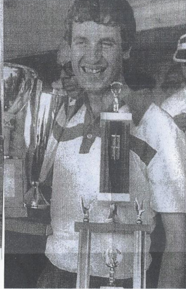
Extra 19 january 2002